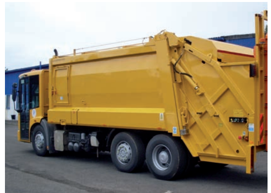
Pics: Refurbished Customer RCVs carried out at Arundel (top) and Hillend (bottom)

Should you require After Sales Care or you would like to know more about the services offered please contact: